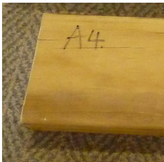
Figure 1: Representative specimen (front face)

The product submitted by the client for testing was identified by the client as FLAMEfixx dFx ® , a fully impregnated chemical treatment combining a durable wood preservative (Hazard Class – H3) and a flame retardant within the same substrate. The flame retardant product is a non-leachable material based on an inorganic metal oxide composition. Figure 1 illustrates a representative specimen of that tested.